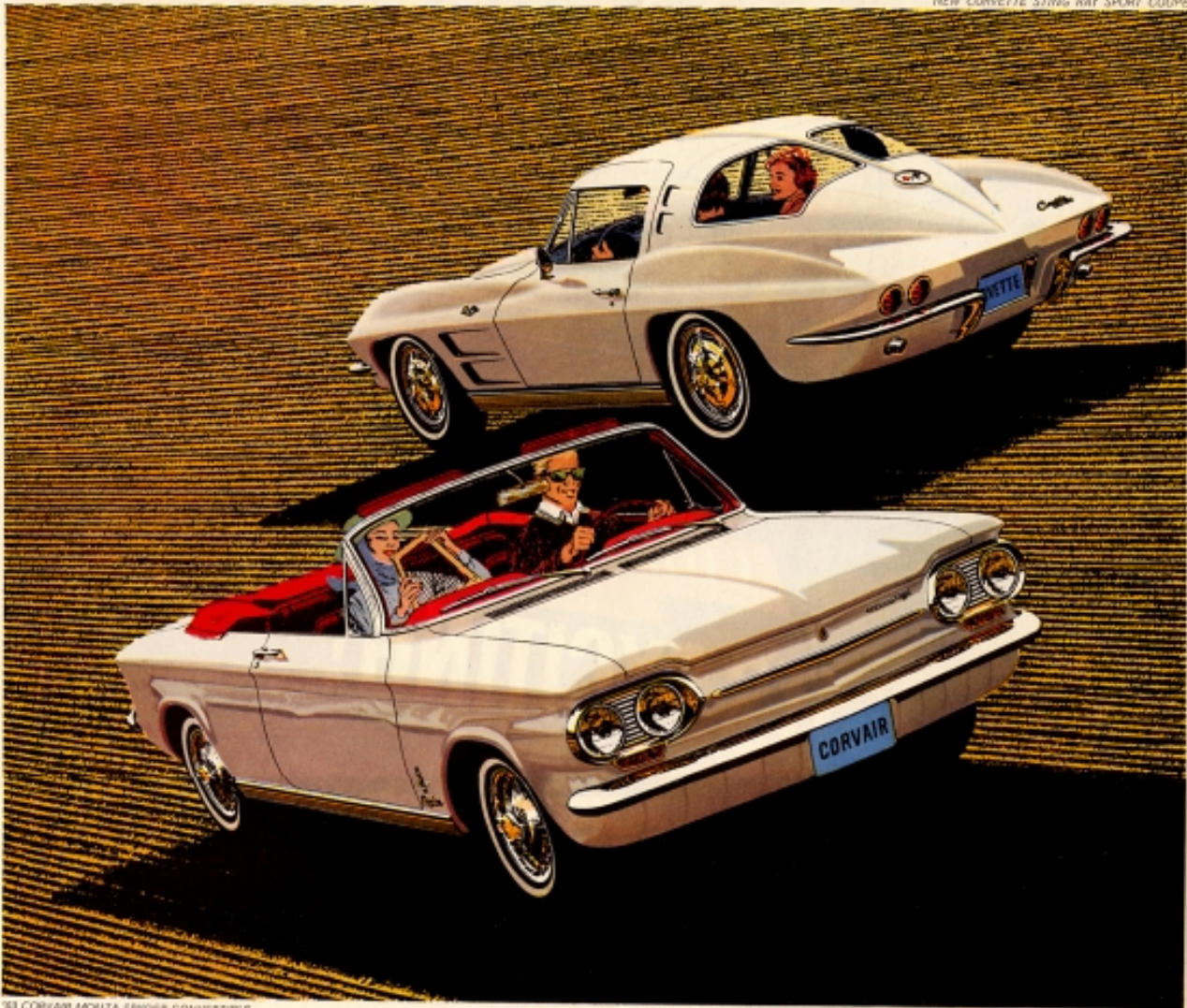
'63 CORVAIR MONZA SPYDER CONVERTIBLE